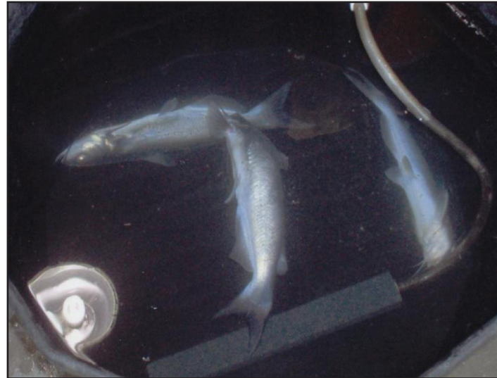
Catfish, affected by VTC, swimming in a vat on their sides (still alive) because they lost neuromuscular control to swim upright.

typical of VTC-affected fish were considered positive. Sera that did not cause mortality in sentinel fingerlings within 96 hours were considered negative.