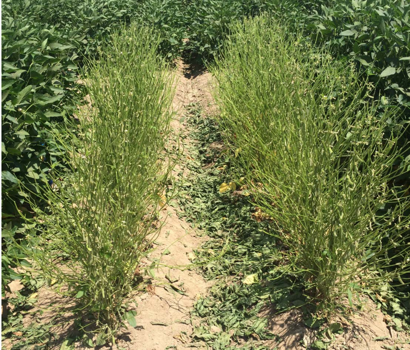
One of the hand-defoliated plots within the study at Delta Research and Extension Center.

of 66 and 100% at R3, and 33% and 66% occurring season long resulted in soybean yields significantly lower than the untreated control. No season long defoliation level reduced yield significantly below its respective R3 treatment. These results indicate that defoliation occurring during vegetative growth stage has