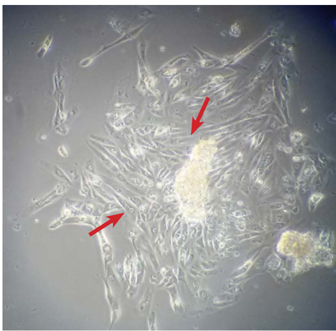
Figure 2A. Channel catfish kidney cells four days post incubation visualized through an inverted phase contrast microscope at 200x magnification.

experimental diets, identifying a feed-related anemia. Feed samples were negative for pesticides, heavy metals, mycotoxins and other potential chemical contaminants. The water soluble feed extract was inoculated onto channel catfish ovary (CCO) cells. Cell death was observed after 48 hours indicating the presence of possible toxins in the feed. Similarly, fish serum from affected fish inoculated onto CCO cells also caused cell death. While the bioassay does not identify the causative agent, it is suggestive of the presence of a bio-toxin not detected by feed analysis.