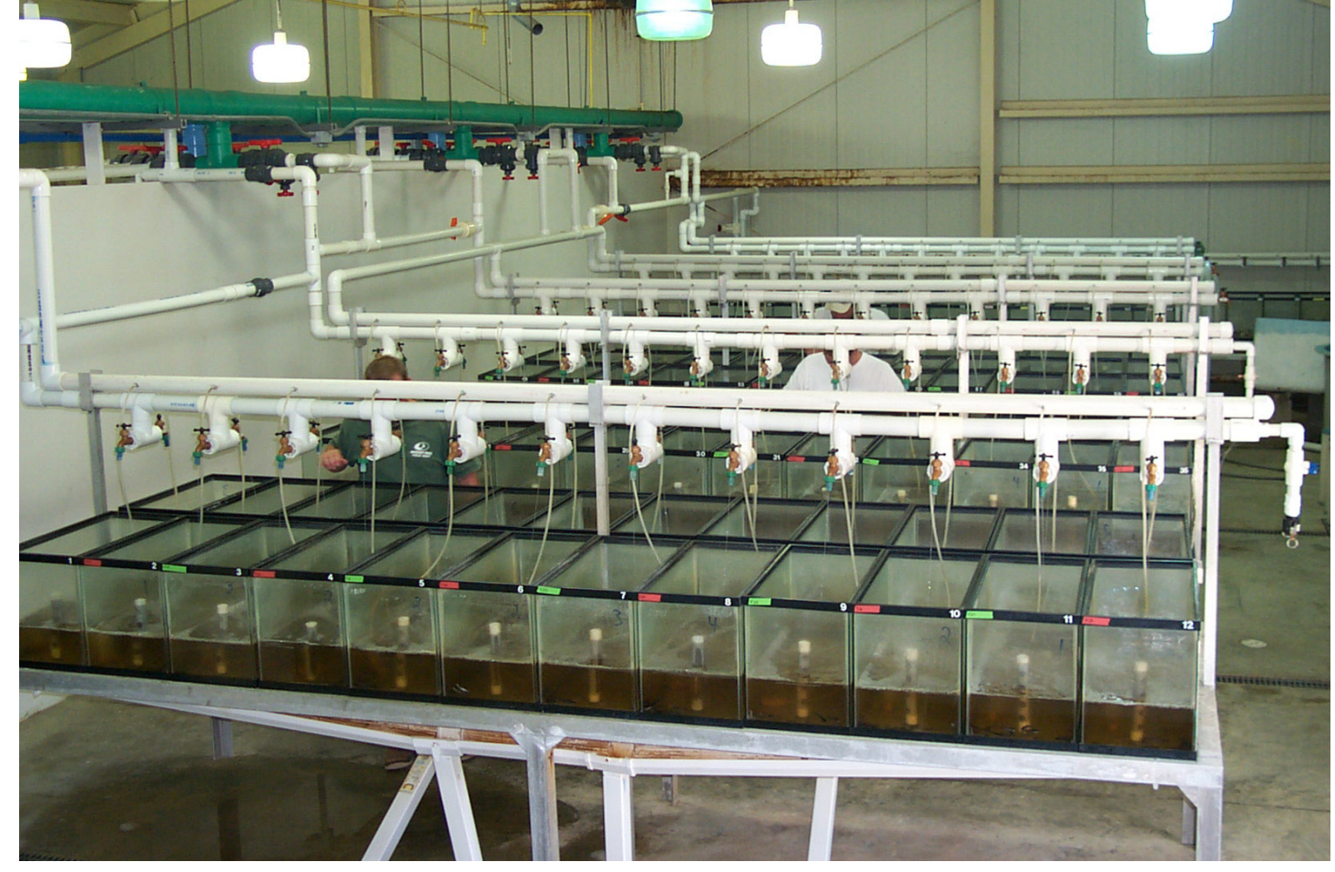
The wet lab that is housed in the Thad Cochran National Warmwater Aquaculture Center at Delta Research and Extension Center.

is antigenic variation among pathogen species, where immunization with a vaccine derived from one strain does not provide protection against genetic variants of the same species.